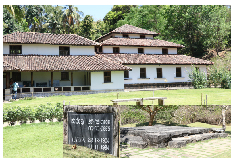
Kavimane - Kuvempu's childhood home; Inset is Kuvempu's Memorial

Kollur's Mookambika temple in Udupi district, a famous Hindu pilgrim center, marked our next visit before