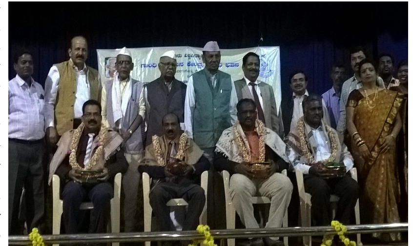
Dignitories being honored on the occassion of Gandhi bhavan's golden jubilee commemmoration

He further extolled scholars and students to inculcate Gandhian philosophy and principles, and build a con-